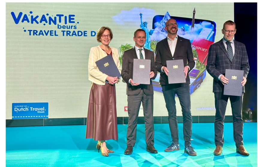
The agreement was signed in early January 2025